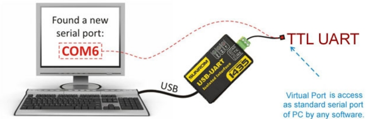
Figure 1 After connecting, “a virtual serial port” is created in your PC. Within the system it acts like a standard serial COM port.

A virtual serial port is created in the PC to access the serial line. LEDs indicate power on and data transmit and receive status.